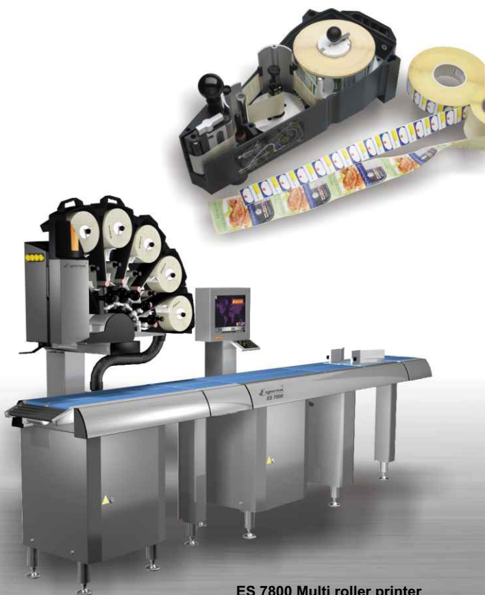
ES 7800 Multi roller printer

With only one printer and labelling system, but with 5 fan-shaped cassettes for different labels, the ES 7800 can label goods without loss of time for article or label change. Thereby one product can be labelled individually non-stop or different products will be labelled with different labels: The multi roller printer opens up new possibilities for an efficient and space-saving weigh price labelling system – all at a convincing price performance ratio.