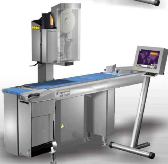
ES 7011 in IPX4 version