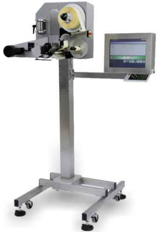
ES 9300 Print & Apply solution for any conveyor system

For fast labelling of products with changing label information. This range covers models from the standalone printer up to multi roller printer that can apply several labels in one cycle only up to models that can be integrated in existing machines.